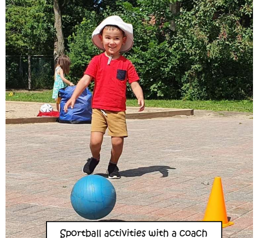
Sportball activities with a coach