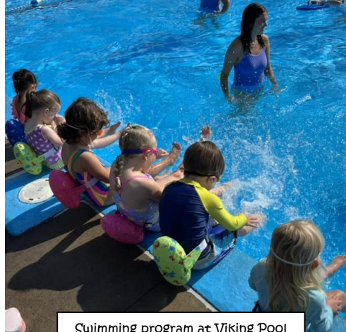
Swimming program at Viking Pool (from 3 years old)