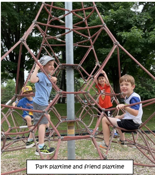
Park playtime and friend playtime