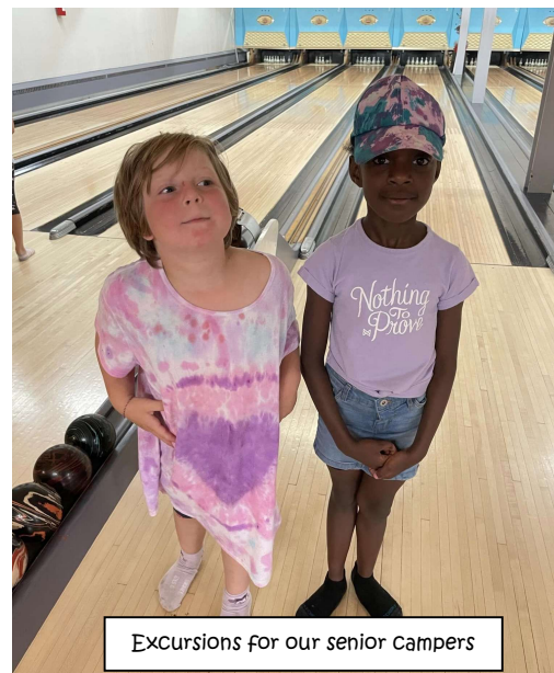
Excursions for our senior campers