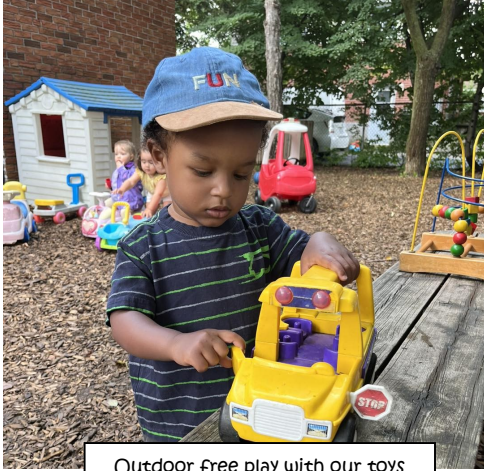
Outdoor free play with our toys

Our activities during the summer are outdoors by preference, but we have excellent air-conditioned facilities indoors to “cool off” or for rainy days. Our monitors keep us busy with many captivating activities. We will participate in games, crafts, sports, sing-alongs to name just some. We also have specialists, one per afternoon, who come to lead us in something different and fun!