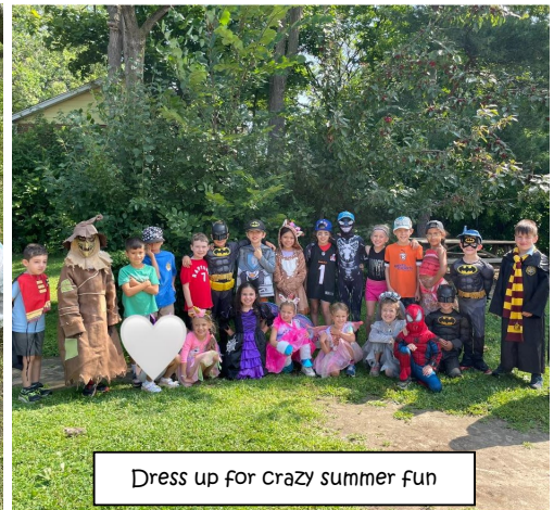
Dress up for crazy summer fun