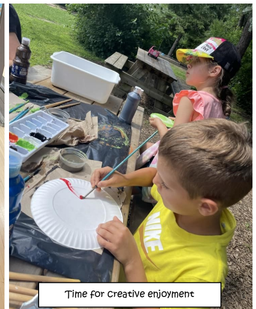
Time for creative enjoyment