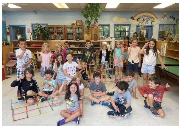
Indoor "Campground" air-conditioned fun with friends