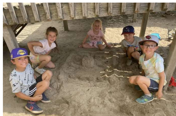
Everyday outdoor adventures